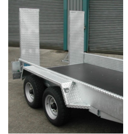
Heavy Duty Slip Resistant Chequer Plate Loading Ramps and Mudguards