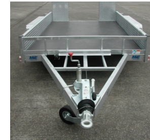
Bucket Rest Integrated into A Frame