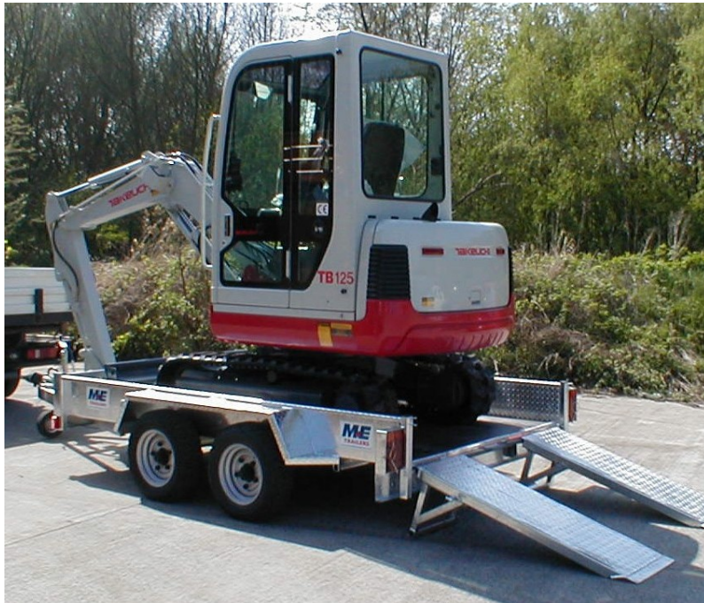
Dimensions & Weights are given as a guide only. We reserve the right to alter specifications without notice