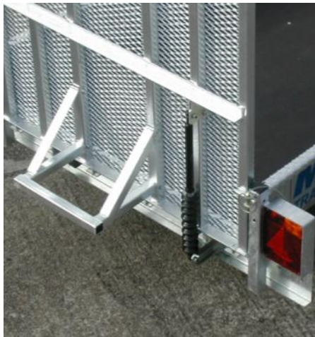
Optional Gas Assisted Ramp Lift